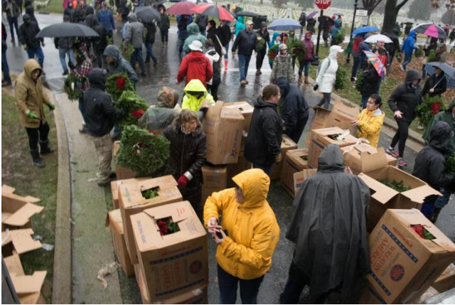
Volunteers lined up in the pouring rain to respect and honor our fallen comrades.

recognition of those who lost their lives in order that we may have freedom.