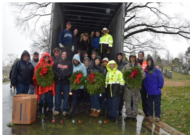
Wreaths Across America honors our fallen comrades at national cemeteries across the United States, including Arlington National Cemetery.