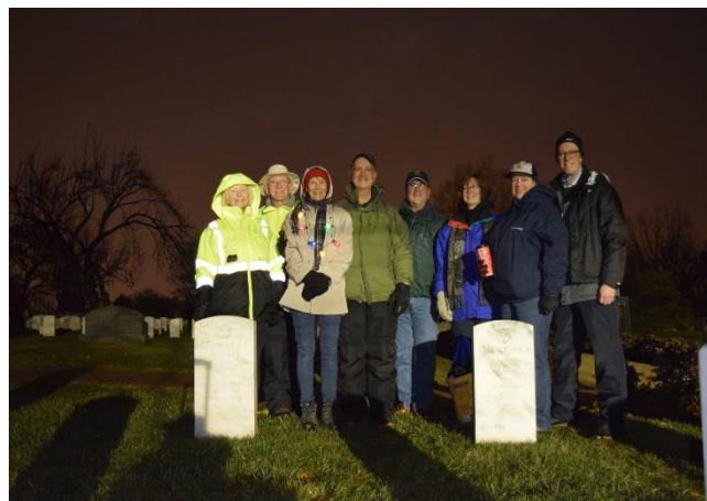
Truck 30 Crew gathered in the pre-dawn rain to prepare for the volunteers arriving at 8:00. Despite the rain, the 48-foot truck was emptied in about two hours.

The Wreaths Across America opening ceremony started at the McClellan Gate. Thousands of volunteers were lined up to accept wreaths from the Gabriel Chapter truck crew by the time permission was given to begin distribution at 8:00.