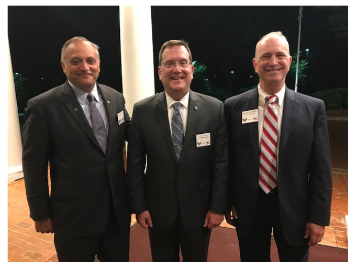
Sleep safe tonight, your EXCOM is awake!