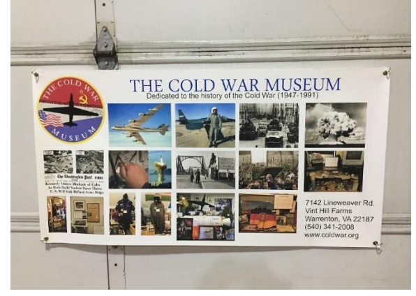
The Cold War Museum is a 501(c)(3) charitable organization. CWM is a Gabriel Chapter Community Partner and we are proud to recommend the excellent educational and professional developemnt opportunities at the Museum.

An AFA Gabriel Chapter Community Partner, the Cold War Museum<sup>®</sup> is a 501(c)(3) charitable organization dedicated to education, preservation, and research on the global, ideological, and political confrontations between East and West from the end of World War II to the dissolution of the Soviet Union. Located in Vint Hill, VA, the Museum Collection is housed in one of the former Vint Hill Farms Station buildings used during the Cold War by the US Army, the National Security Agency, and the Central Intelligence Agency to intercept and interpret coded messages. Museum collections are particularly strong with unusual artifacts in signals aerial intelligence, image intelligence,