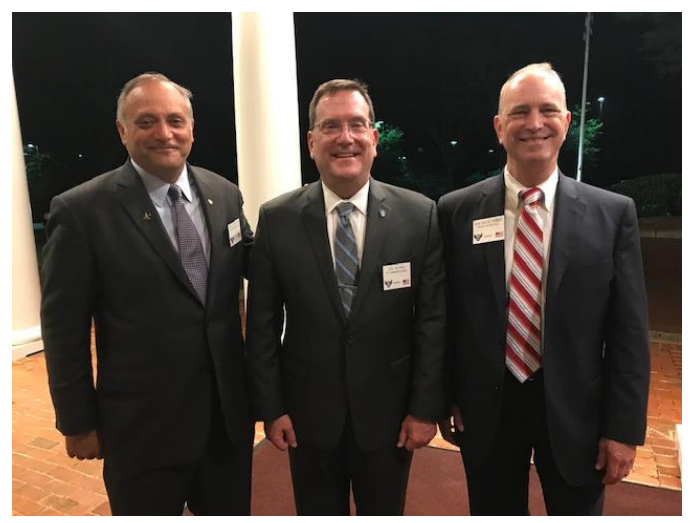
Gabriel Chapter leadership joined attended the Virginia AFA State Convention and EXCOM Meeting in Williamsburg, Virginia, hosted by the Langley Chapter

We are now entering the summer months and have several Chapter and National events coming up here in the National Capital Region, including the AFA National Convention, the AFA Field Awards Dinner, the AFA Air Space and Cyber